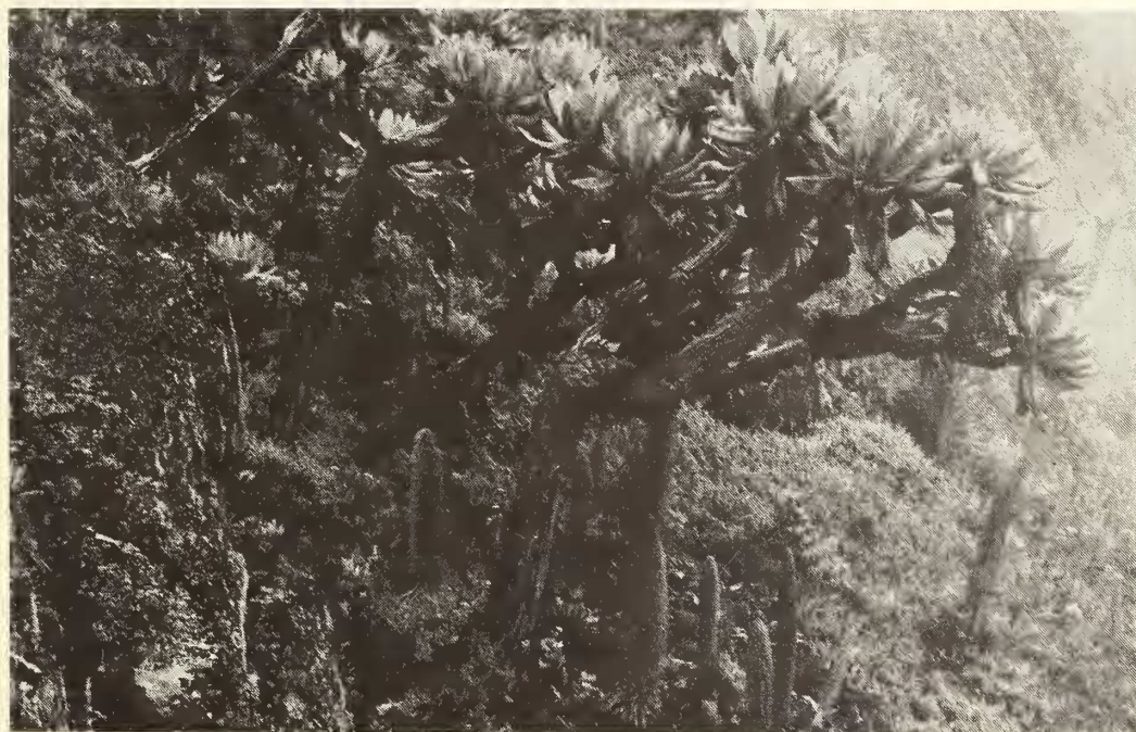
Fig. 5 Close up the Dendrosenecio barbatipes -Community at the western slopes of Koitoboss summit (cf. plot 8 in Table 2). D. barbatipes , Lobelia telekii and Alchemilla elgonensis and Helichrysum amblyphyllum can be detected on the photo as important representatives of this community (Foto: E. Beck, March 15th, 1983).